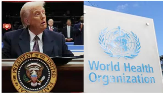
Trump signs executive order to withdraw US from WHO.

Although this decision creates new challenges, Rotary remains dedicated to ensuring that every child is protected from